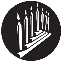
Kwanzaa . . . . .65