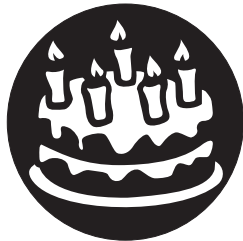
Happy Birthday . . .67