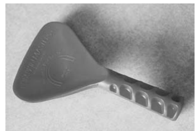
Pumpkin Masters® Scraper Scoop™