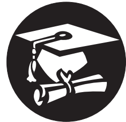
Graduation . . . . .71