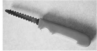
Safety Pumpkin Carving Knife

Pumpkin scoop - scraping tool. I have found that the scoop that comes with the kits sold by Pumpkin Masters® during the Halloween season works perfectly for scraping (visit www.pumpkin-masters.com for more information on their tools). You will use this for the final cleaning and scraping of the inside of the watermelon.