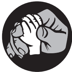
Baby's Hand . . . .105