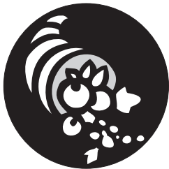
Horn of Plenty . . .57