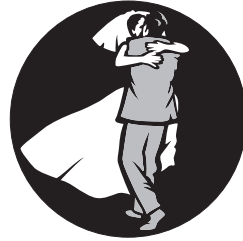
Bride & Groom Kiss . . . . .99