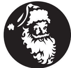
Santa . . . . .87