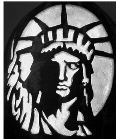
The temporary nature of a carved watermelon demands attention while it lasts.

With the growing interest in watermelon carving, more people are looking for information on the subject. Those new to it want to know how to get started. Those familiar with it want to learn more shortcuts and techniques for doing it better and quicker. In this book I have assumed the reader has no previous experience with watermelon carving. Beginners as well as those with experience will benefit from all the tips, tricks, and techniques I have included in these pages.