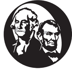
Washington & Lincoln, US Presidents 101