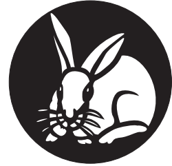
Easter Bunny . . . .55