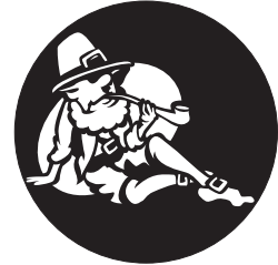
Leprechaun . . . . .79