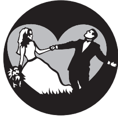
Bride & Groom . . .97