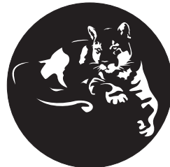
Mountain Lion . . .93