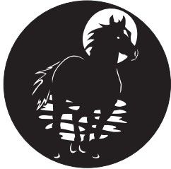
Moonlight Stallion .73