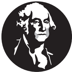
George Washington . . . . .103