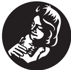
Mother & Child . .83