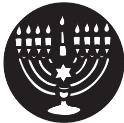
Hanukkah . . . . .59