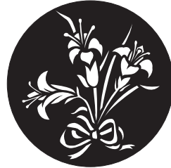
Daylilies . . . . .77