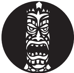
Tiki . . . . .89