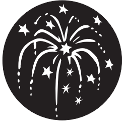
Fireworks . . . . .49