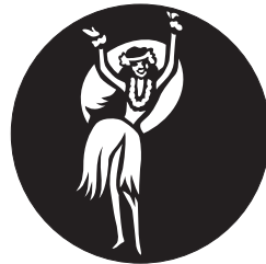
Hula Dancer . . . .69